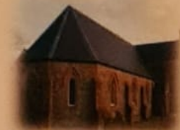
Our Lady & St Joseph's