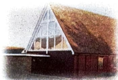
Our Lady & St Joseph's